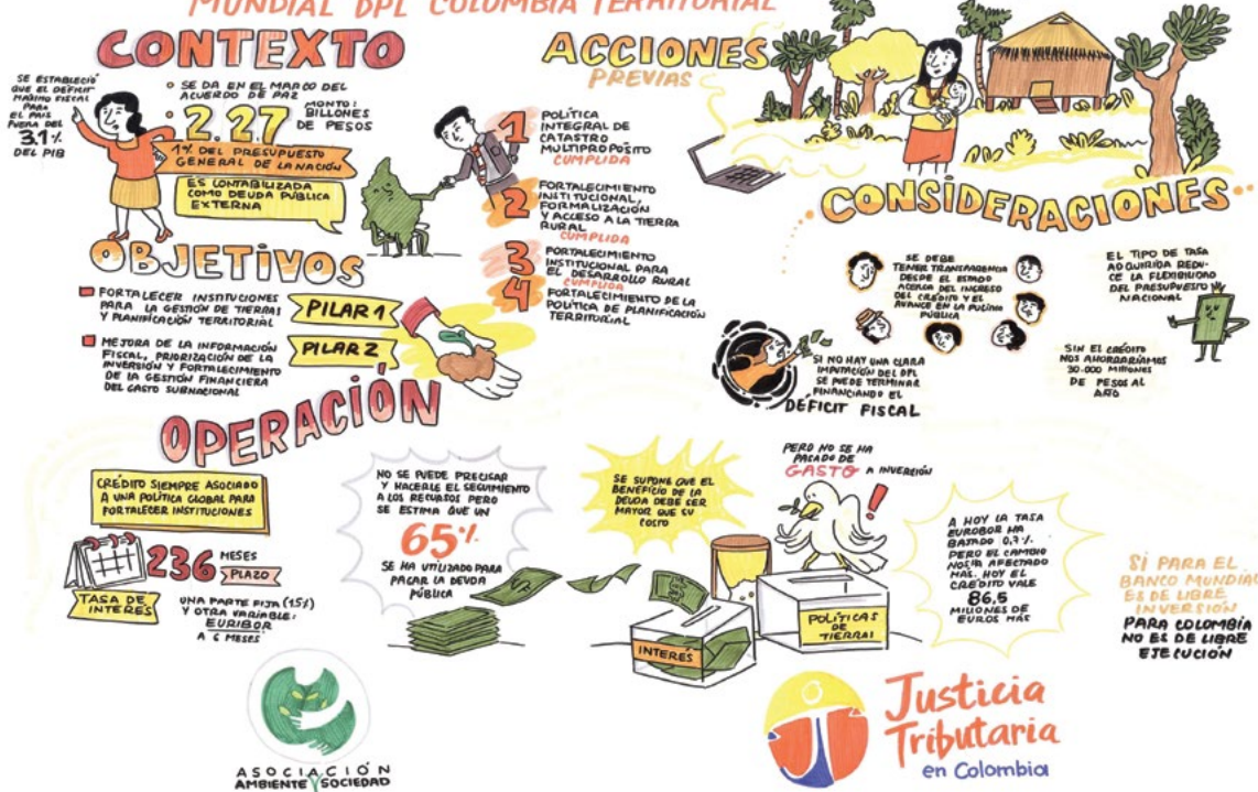
FIGURE N2: Results from presentations given at the workshop “Analysis of the impacts of World Bank lending for territorial development policy in Colombia” Bogotá, Colombia February 20, 2018

type of multilateral development bank lending with ‘free destination’ budget support for the country to finance its fiscal deficit. 100 Given the lack of transparency around how DPF money is allocated within Colombia’s budget, it is not possible to evaluate if the benefits of the loan are greater than the costs. 101