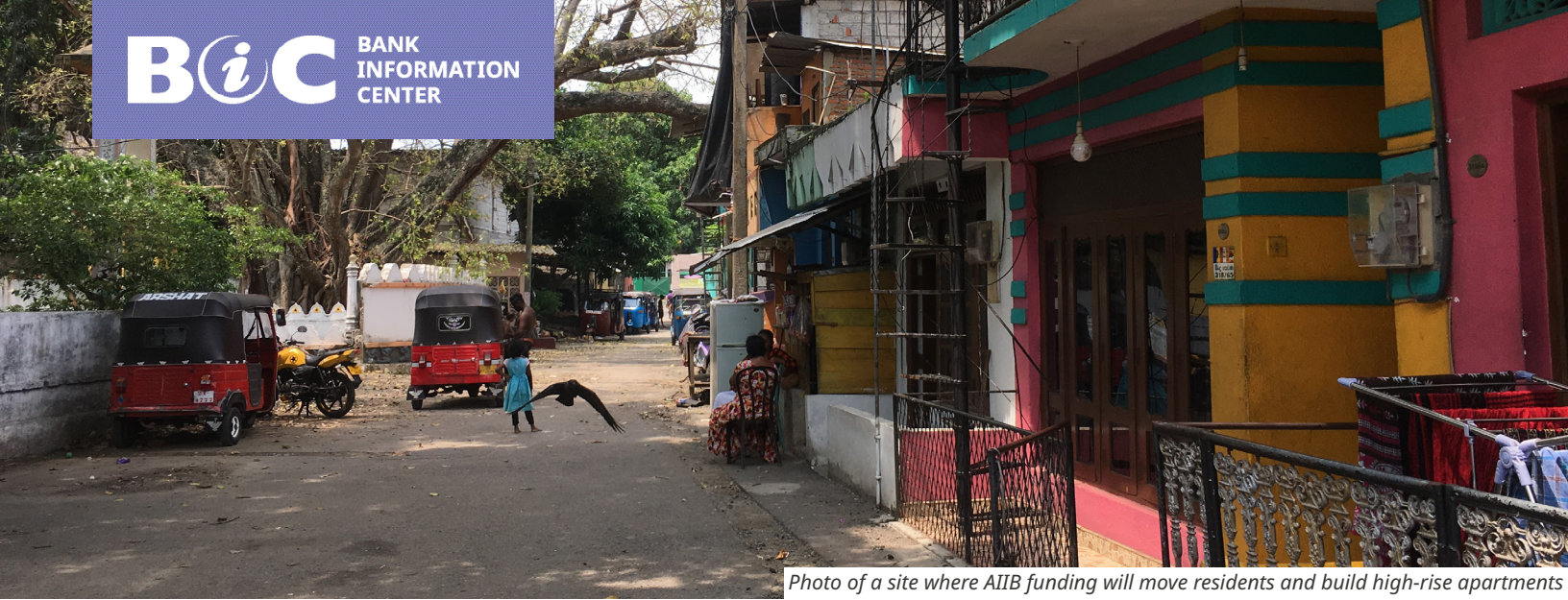
Photo of a site where AIIB funding will move residents and build high-rise apartments